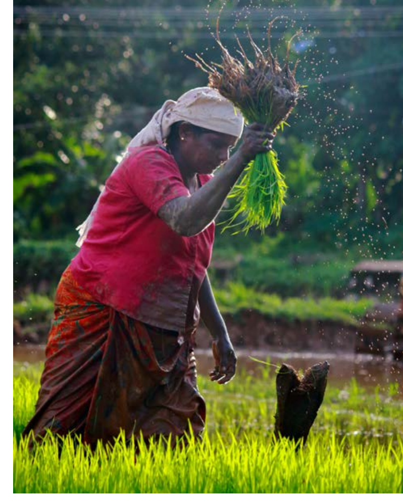
Woman Farmer, Paddy Field, Nedumangad, India.

The global water crisis is evolving extremely rapidly. There is insufficient time to replicate three decades of climate change negotiations and conventions and, therefore, any recommendations need to provide for a dramatic acceleration of progress.