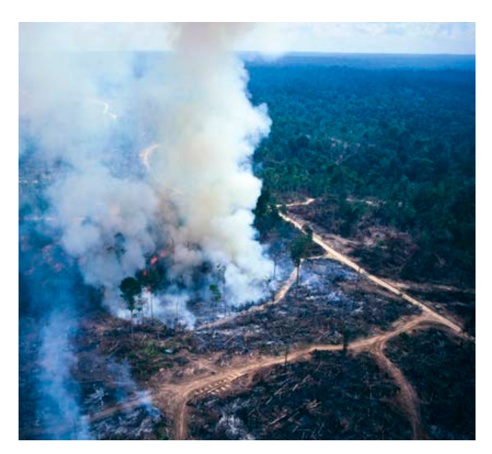
Slash-and-burn farming for palm oil production in Sumatra.

Finally, Article 5 of the Paris Agreement now introduces the concept of a results-based payment where countries are paid to maintain forests based on a per tonne of carbon sequestered. In these instances, there is no sale or transfer of RFDD+ credits. The Green Climate Fund and the World Bank as Trustee for the Forest Carbon Partnership Facility have endorsed this approach and, as a result, the party protecting the forest is paid to do so, providing a direct financial value to the forest. This arrangement is also close to "Payments for Ecosystem Services" schemes which focus more on the noncarbon, biodiversity, and water-related benefits of nature.51