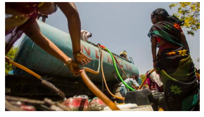
Indian residents fill water containers from a government water supply truck.

Lessons can be drawn from energy where decentralised, highly efficient infrastructure is increasingly being deployed to manage energy infrastructure challenges. In water, this could include the deployment of nature-based solutions to recharge river basins, recharging groundwater supplies through (for example) increasingly porous surfaces or decreasing reliance on groundwater withdrawals for (for example) agriculture. It may also include increasing management of surface water in times of flooding or surplus.