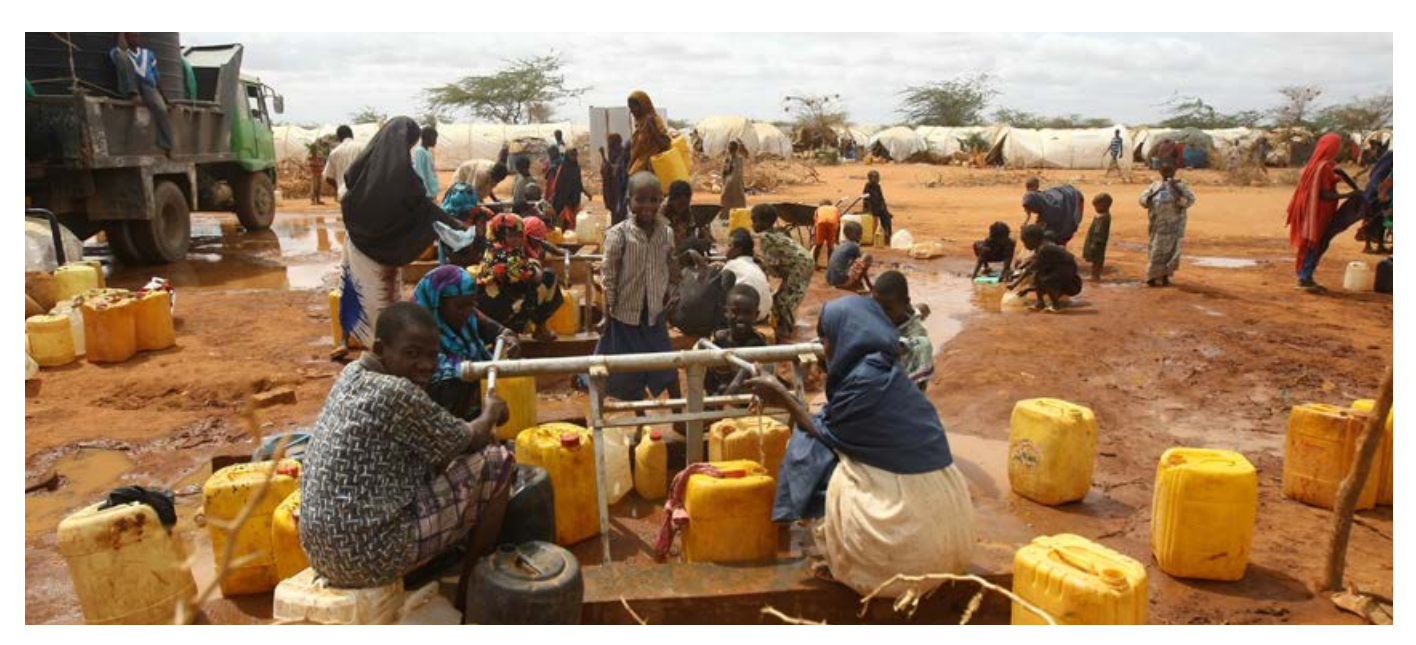
Somalian refugees fetch water at the new Ifo-extension in Dadaab Refugee Camp, Kenya.

With this in mind, one option is to ensure water-related financial disclosures are included in the continuing development and evolution of the TNFD. Another option is to develop a new TWFD – a Task Force on water-related Financial Disclosures. This could avoid the complexity of attempting to include water within a broader nature discussion where water often gets sidelined or rolled into considerations like "biodiversity" instead of being recognised in its broader context. Like the TCFD has done for climate, this would create a focus on water-specific issues which relate across the breadth of value chains, and create specific disclosure guidelines for how corporates report on specific water risks and their corresponding risk-management strategies.