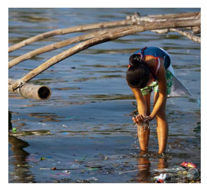
Woman washing her hands in the heavily polluted waters of the Paranaque River, Manila, Philippines.

Even where water is available it is not always clean, causing real challenges in the provision of drinking water, and basic sanitation and hygiene ("WASH"). Around the world, approximately 785 million people do not have access to improved water sources,* and just over one-third of the world's population lacks access to improved sanitation.^ The vast majority of these are people living in rural areas. Poor water quality is also linked to major health issues in many places around the world where unsafe drinking water is causing more than 2000 children under 5 to die from diarrhea every day. Trachoma, Guinea Worm Disease, Schistosomiasis are all prevalent in areas with unsafe drinking water, poor sanitation, and insufficient hygiene practices.