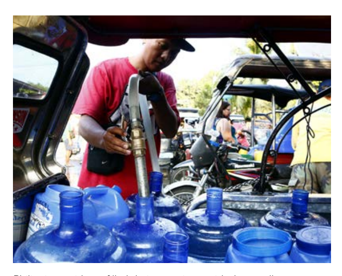
Philippino residents filled their containers with deep well water when a service interruption lasted for days causing water shortage.

release of wastewater, and to treat and recover it.<sup>54</sup> However, without adequate price or other regulatory incentives, or without some form of physical constraint which necessitates greater water efficiency, there is little incentive for many of these technology interventions to be deployed at scale, an experience that was also initially the case with energy efficiency