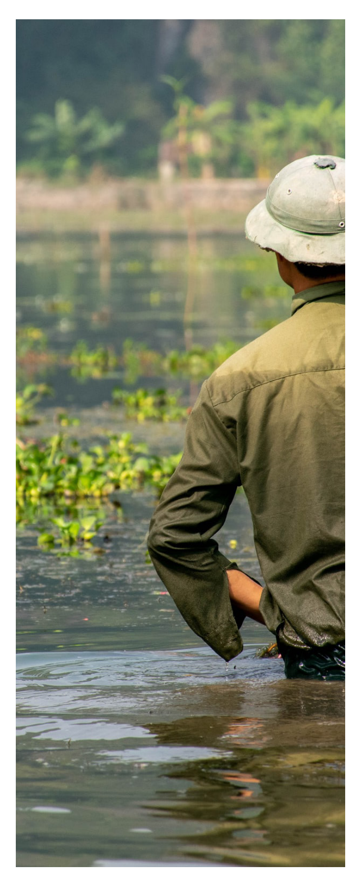
Farmer, Ninh Binh, Vietnam.

The water sector is large and involves what are often complex relationships with various aspects of our economies and our societies. Rather than attempt to unify around a single approach to solving water problems, we need to learn from climate change where the single-solution approach failed, and instead look at how the same goal can be achieved through multiple different solutions.