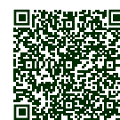
Awajún life plan