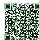
Shampuyacu: The value of a standing forest